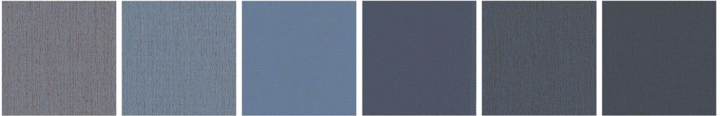
ORANGE/BLUE FABRIC: CHRISTIANSHAVN 1155