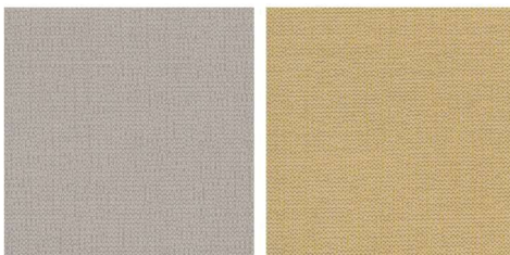
LIGHT BEIGE FABRIC: CHRISTIANSHAVN 1120