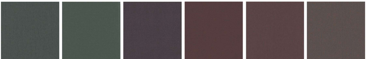
DARK GREEN FABRIC: CHRISTIANSHAVN 1161