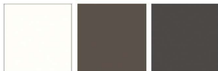
White lacquer NCS 0500-N