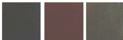
Black 8175 (9110)