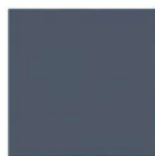
Dark blue lacquer NCS 7812-R85B