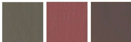
Ardbeg green stain

A coloured oil will be patinated with ware and eventually reveal the natural color of the wood.