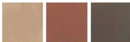
Nature 8800 (9101)

The color pigments are blended through all layers of coating.