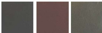
Black 8175 (9110)