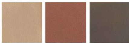
Nature 8800 (9101)

A coloured oil will be patinated with ware and eventually reveal the natural color of the wood.